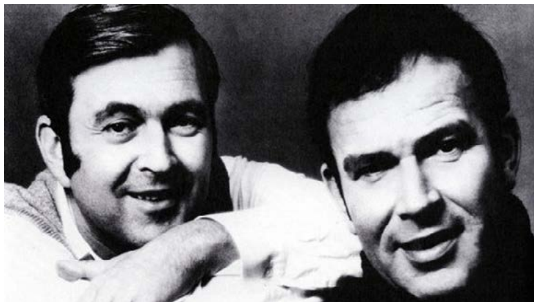
John Kander & Fred Ebb